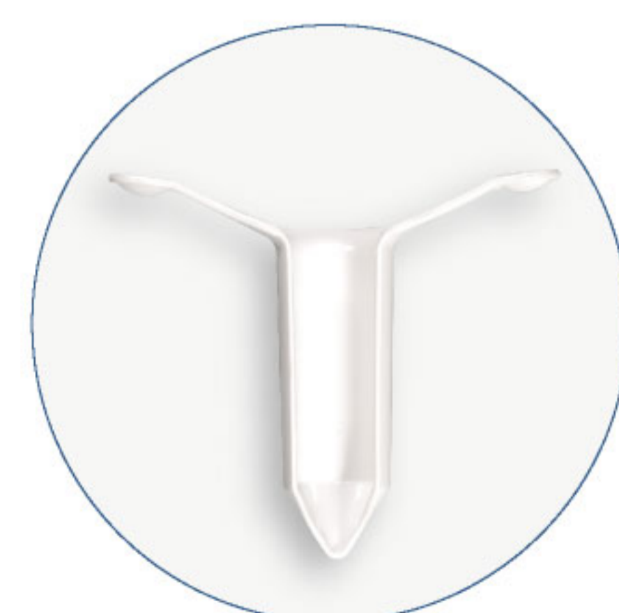
Purse-string Suture Anoscope