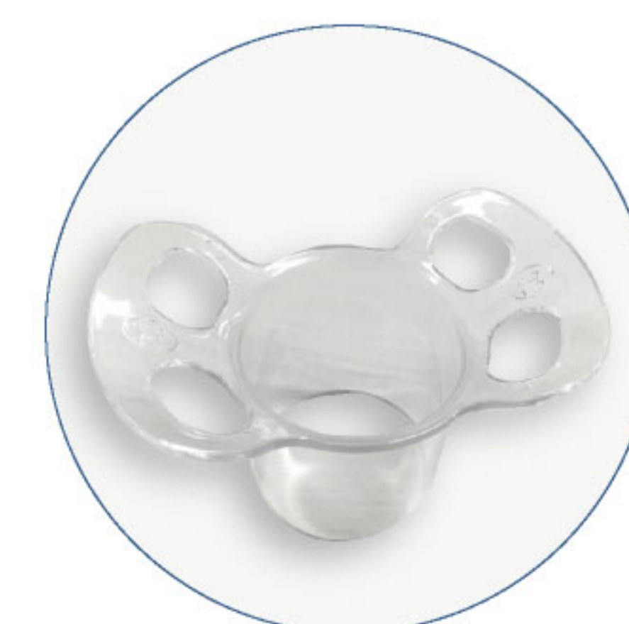
Butterfly Anal Dilator