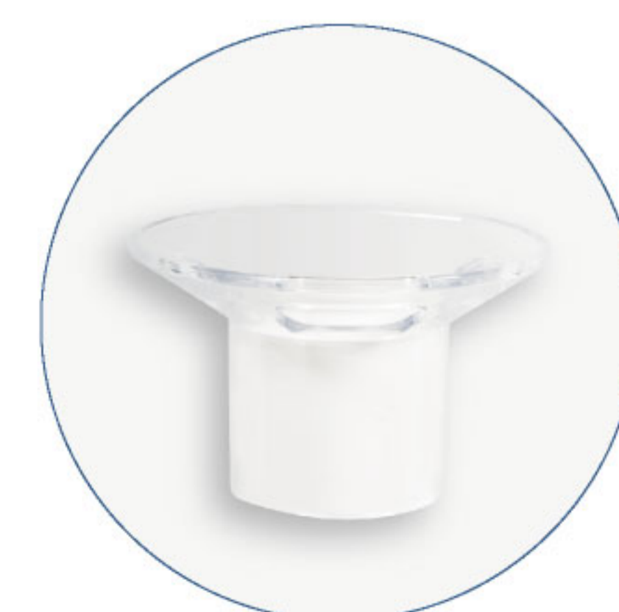
Circular Anal Dilator